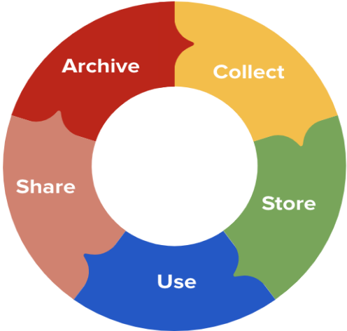
Figure 1: Stages of Data Management

The guide is organised in five stages of the data management lifecycle: